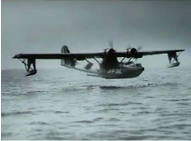
Figure 8. PBY Catalina, 1936-1945. Range; 2,520 miles, 4,030 kms.

The USS Enterprise and the Lexington USA carriers had been sent to Midway with heavy cruiser escorts. Six of Japan's first-line aircraft carriers, Akagi, Kaga, Soryu, Hiryu, Shokaku and Zuikaku, were assigned to the mission with over 420 embarked aircraft. Apparently, the Japanese naval commander, Admiral Chuichui Nagumo, keenly noticed the absence of the USA aircraft carriers and their battle ships and heavy cruisers escorts at Pearl Harbor and cautiously cancelled the third wave of aircraft attacks on the basis of the “loss of the element of surprise,” and possibly on a suspicion of a planned ambush. According to the Japanese attack goals [9]: