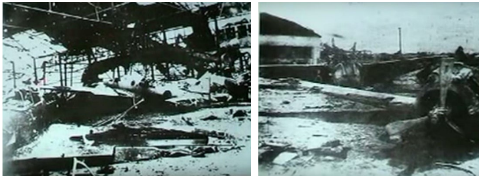
Figure 2. A serious military strike occurred at Clark Field at Manilla, Philippines, 9 hours later on December 8, 1941, where a fleet of B-17 bombers was next targeted and referred to as "McArthur Pearl Harbor."