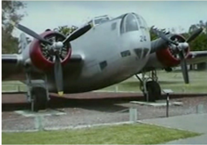
Figure 3. B-18 Bolo bomber. Combat radius: 999 nm (nautical miles), 1,150 miles, 1,850 kms).