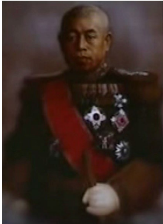
Figure 4. Admiral Yamamoto planned the Japanese attack on Pearl Harbor, waking up in his words, “a sleeping giant.” His plane was ambushed at the later stages of the war after breaking the Japanese communication code.