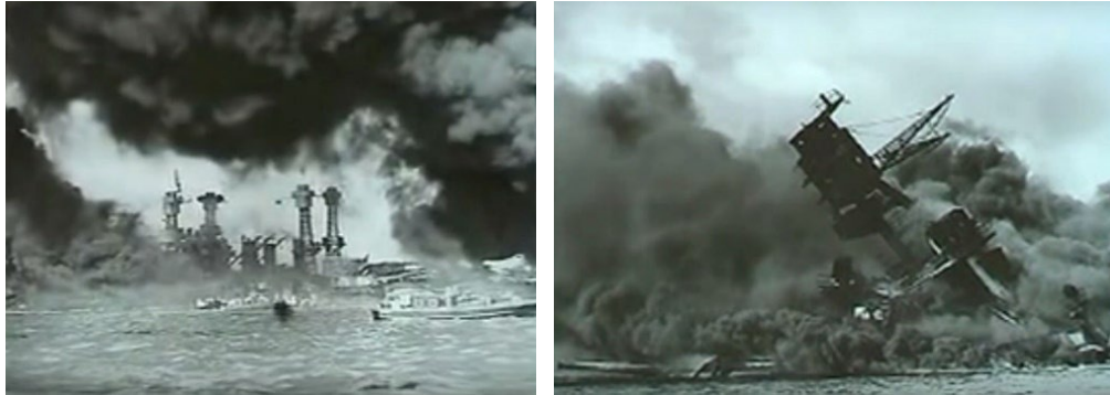
Figure 1. Attack by Japan on the USA Pacific fleet stationed at Pearl Harbor, Hawaii, December 6, 1941. The Arizona and four obsolete World War I ships were affected. Conspiracy theorists debate, based on intercepted intelligence, whether the best ships, including the aircraft carriers, in the seventh fleet were conveniently sent out of harm's way when Pearl Harbor was attacked, leaving only the older less seaworthy ships to be sunk, and giving President Roosevelt the "casus belli" he needed to involve the USA into World War II.

attacking the USA's Pacific Fleet stationed at Pearl Harbor, Hawaii. Pearl Harbor was Japan's second naval surprise attack. It began the Russo-Japanese War of 1904-05 by sailing into the Port Arthur harbor and blasting the Russian Pacific Fleet into smithereens, even though the two countries were not formally at war.