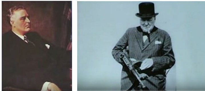
Figure 5. Despite public opposition, USA President Franklin D. Roosevelt was lured into World War II by Winston Churchill of the UK, married to an American lady, in a mafia-like pose with a machine gun.

“ we show that Churchill was aware that a task force had sailed from northern Japan in late November 1841, and that one of its likely targets was Pearl Harbor. Churchill deliberately kept this vital information from Roosevelt [as] a means of fulfilling his ... desire to get America into the war at any cost.”