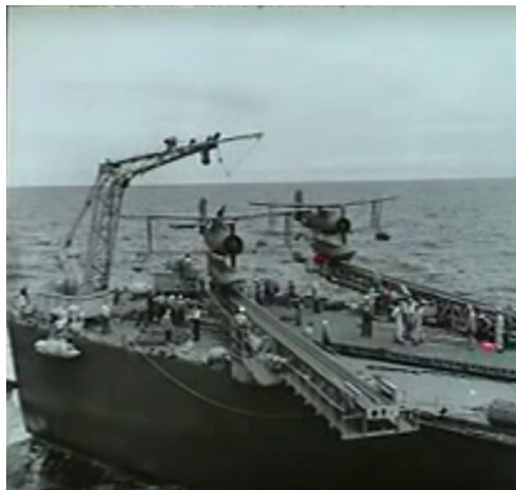
Figure 7. Curtiss SOC “Seagull” scout-observation planes launched from cruisers. Range: 675 miles or 1,086 kms. Pearl Harbor attack was launched from 250 miles out of Pearl Harbor.

“On 5 December 1941, TF-12, formed around Lexington, under the command of Rear Admiral John H. Newton, sailed from Pearl to ferry 18 Vought SB2U-3 Vindicators of Marine Scout Bombing Squadron 231 to Midway Island. Dawn on 7 December 1941 found Lexington, heavy cruisers Chicago (CA-29), Portland (CA-33), and Astoria (CA-34), and five destroyers about 500 miles southeast of Midway. The outbreak of hostilities resulted in cancellation of the mission and VMSB-231 was retained on board [they would ultimately fly to Midway from Hickam Field on 21 December].”