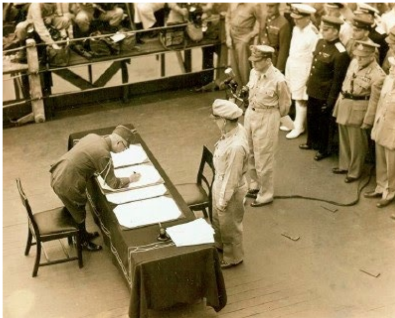
Figure 10. On September 2, 1945, Japanese envoys signed the instrument of surrender aboard the USS battleship Missouri in Tokyo Bay, ending the World War II conflict and avoiding a Russian incursion into their northern islands.

Nevertheless, much like in the Alsos team in Germany, the USA military gathered and destroyed for show and public relations several pieces of equipment that were erroneously deemed essential for the production of an atomic device, including the largest cyclotron in the world at the time.